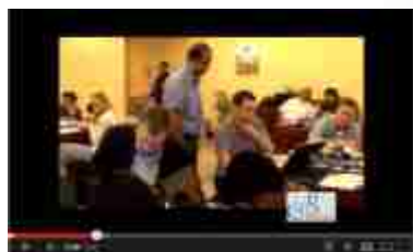
CPPR-ACE Winter School 2013