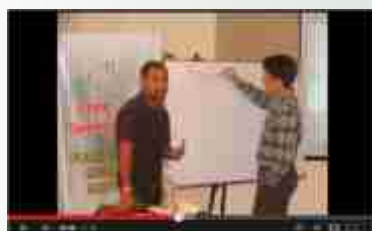
CPPR-ACE Summer School 2012