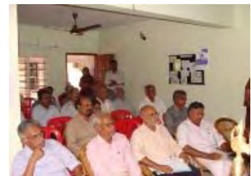
Senior Citizens Forum